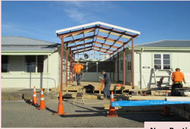
New Portico to the Church