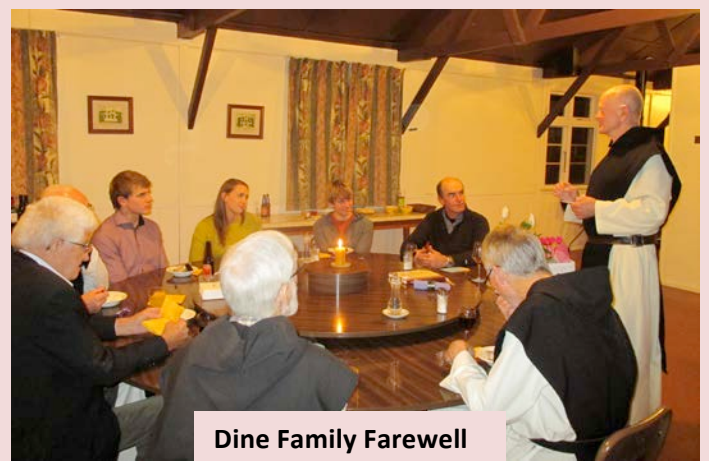
Dine Family Farewell