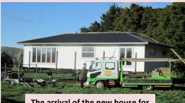
The arrival of the new house for married Companions