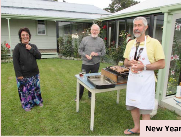
New Year's Day BBQ