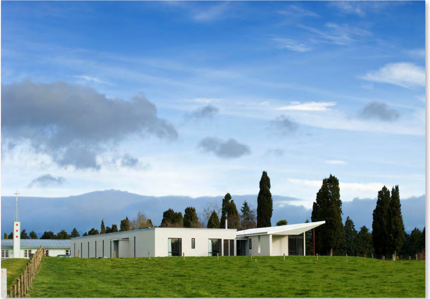
Southern Star Abbey church and the award winning guesthouse looking towards the Ruahine Ranges.